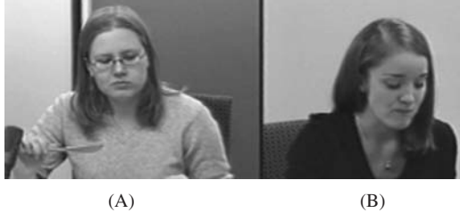
FIGURE 15 Extract 5, frame 10.