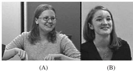
FIGURE 18 Extract 5, frame 13.