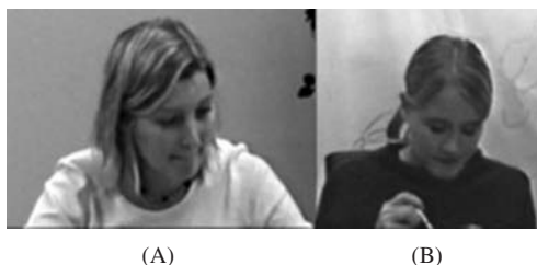
FIGURE 7 Extract 3, frame 1.