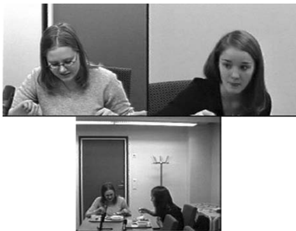
FIGURE 1 Seating arrangement.

Our data consist of Finnish two-party everyday conversations. A somewhat constrained environment was needed to secure the technical quality of recordings necessary for the analysis of facial expression. We invited dyads of students (who were friends or acquaintances) to have a free lunch while their interaction was recorded with three video cameras. The lunches took place in a room adjacent to a student refectory. Figure 1 shows the seating arrangement