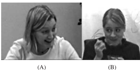
FIGURE 9 Extract 3, frame 3.