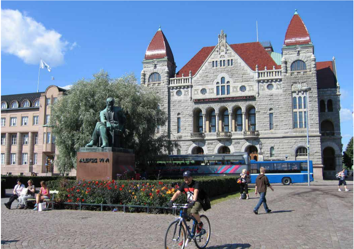
The Finnish National Theatre and the Railway Square in Helsinki.