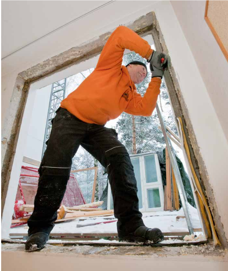
Repairing a window frame.