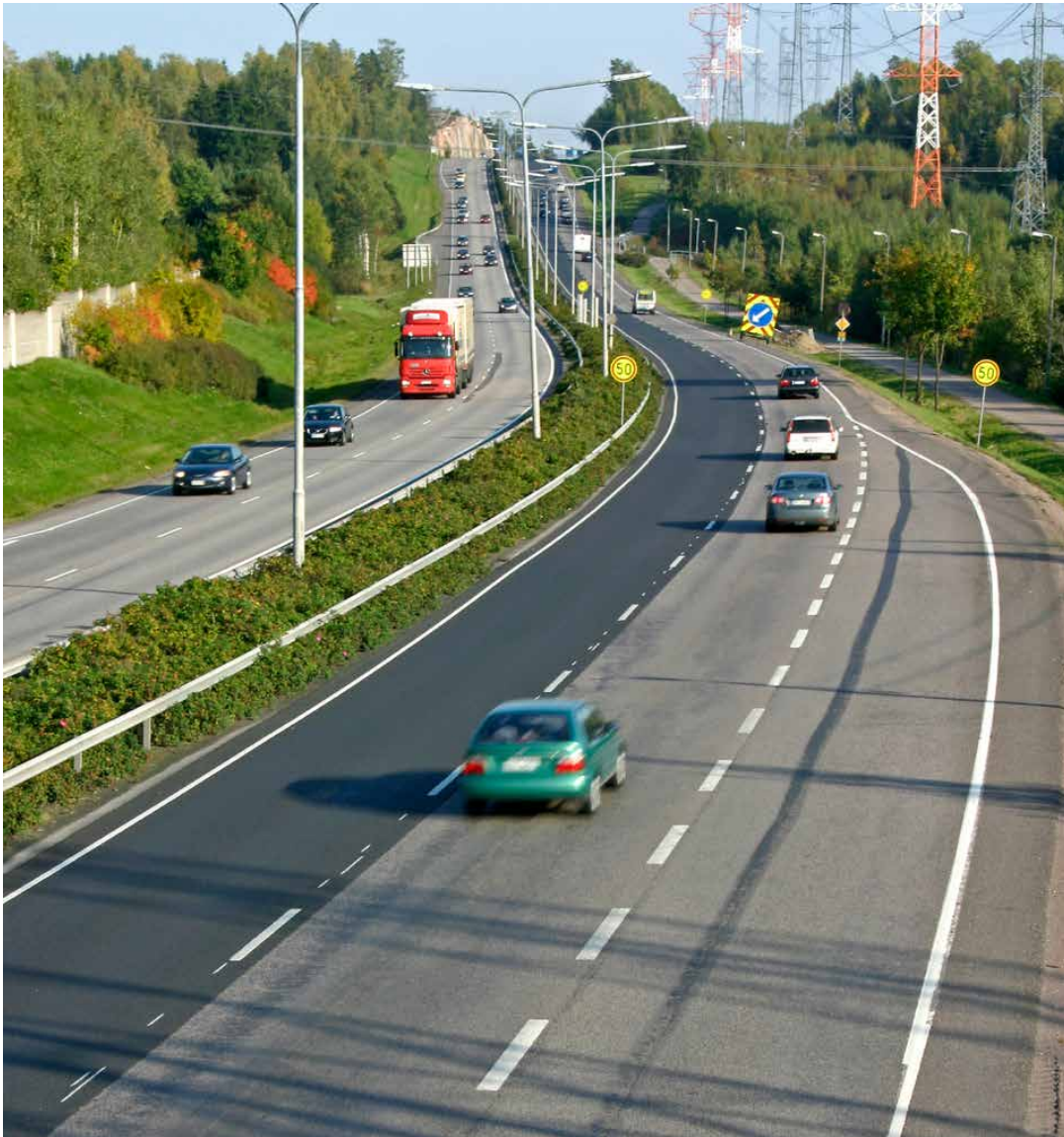
Ring Road III (Kehä III).

International legislation offers good prerequisites for the protection of the cultural environment, but, at the same time, the fragmentation of regulations in several laws poses a challenge to the comprehensive development and protection of the cultural environment.