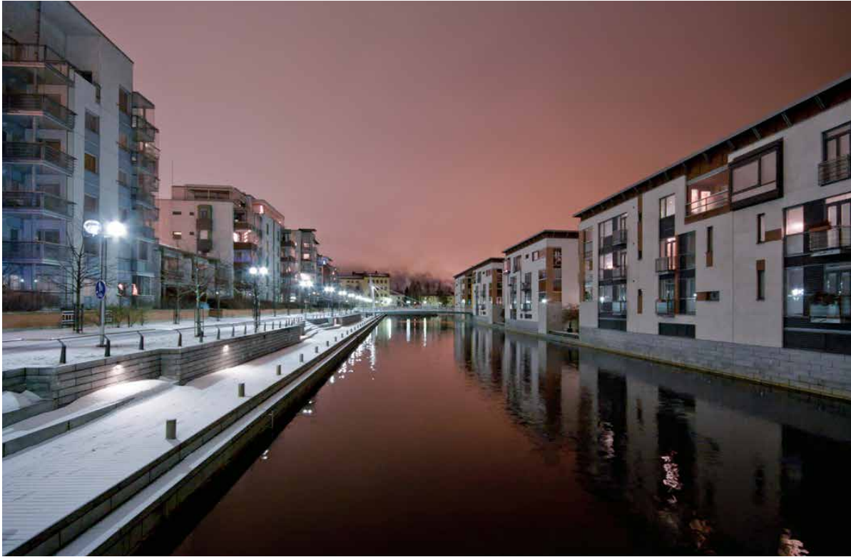
City lights in the evening.