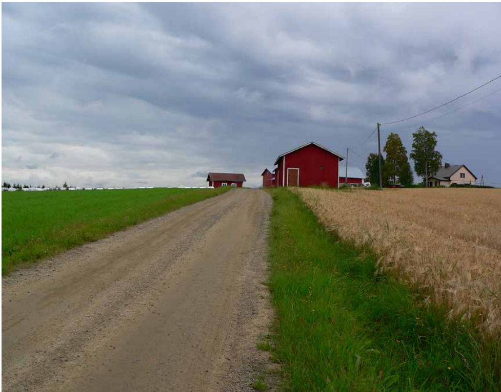
Rural landscape in Mustinmäki, Savo region. Tuija Mikkonen.