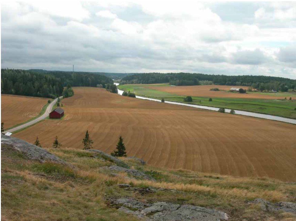
The cultivated landscape of the Lieto Vanhalinna estate is crossed by the age-old routes of the Ox Road of Häme and the Aura River. Tuija Mikkonen.