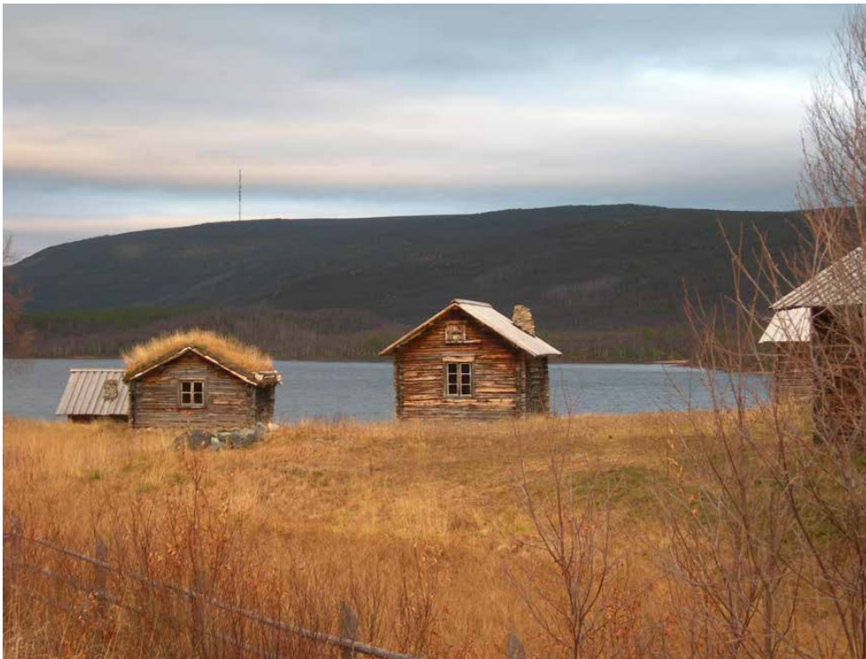
Church barns in Utsjoki. Tuija Mikkonen.

A good land use planning process requires functional interactive procedures and sufficient basic information. Up-to-date basic information is a fundamental prerequisite for assessing the effects of land use planning, which focuses on the cityscape, landscape, cultural heritage and built environment. The inventory “Cultural Heritage Sites of National Significance ( Valtakunnallisesti merkittävät rakennetut kulttuuriympäristöt , RKY)”, related to the national land use guidelines, is the most central one. Taking it into account in land use is an important national cultural environment goal.