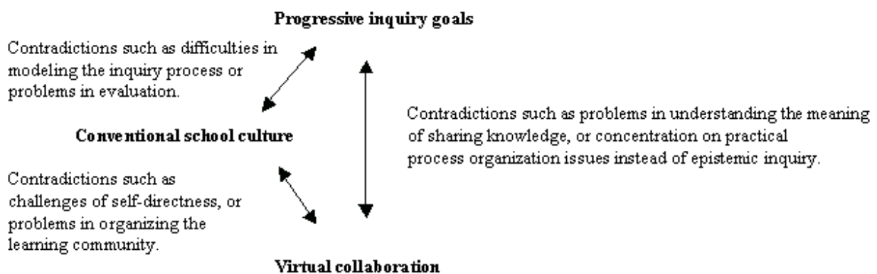
Figure 1. Dimensions for examining the virtual school project.

In summary, the framework for analyzing the challenges of the virtual school project was found in the interaction and contradictions of three elements, as Figure 1 describes.