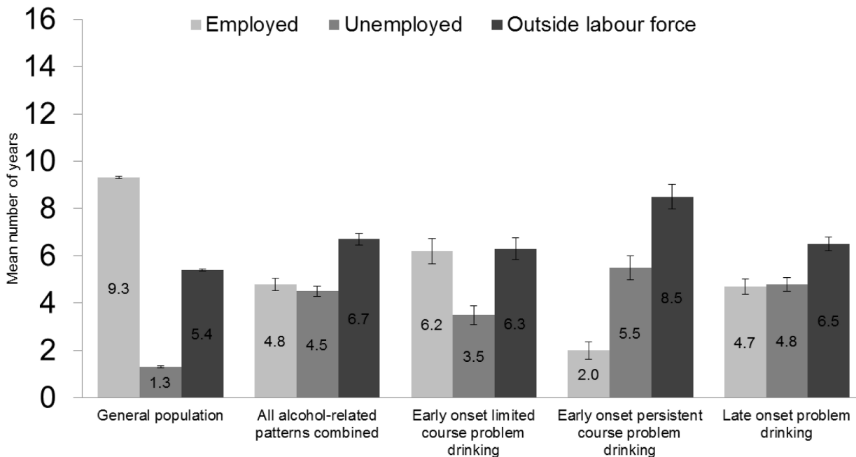
Fig 1. Average number of years employed, unemployed, and outside the labour force over the 16-year follow-up period by retrospectively defined patterns of problem drinking. Means adjusted for cohort, sex, and age at the time of death/end of follow-up. Error bars represent the 95% confidence intervals. Finnish men and women aged 18–34 years.