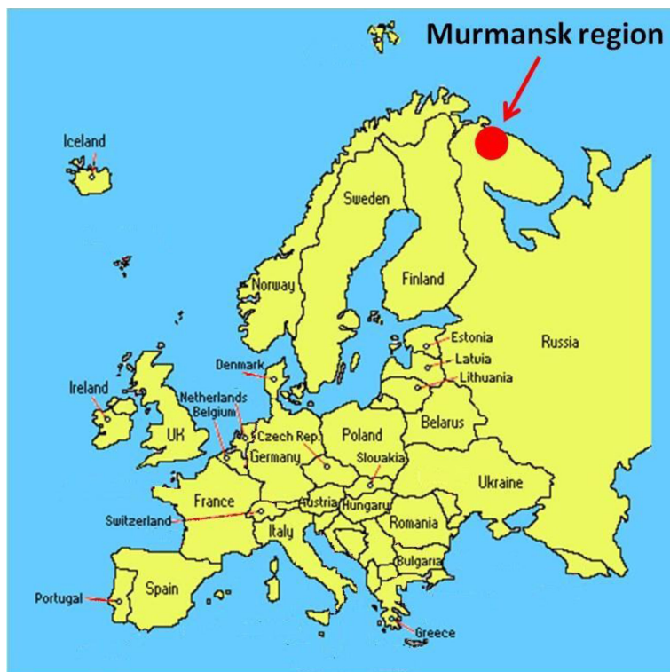
Fig. 1. Murmansk region in the northwest Russia.

habits (8). Earlier consistent evidence emphasized that even non-smokers may develop chronic airflow obstruction (9,10). Inhalational exposures such as occupational dusts and chemicals are harmful environmental contaminants (11). The Murmansk region includes areas where its inhabitants are exposed to contaminants from mining industries. The prevalence of smoking (12) and COPD (13) is high in Russia, though the simple statistics probably do not reflect the scale of the problem in this region. There is an urgent need to investigate the persistence of chronic cough/phlegm symptoms by using specific questions about their predictors, onset and duration.