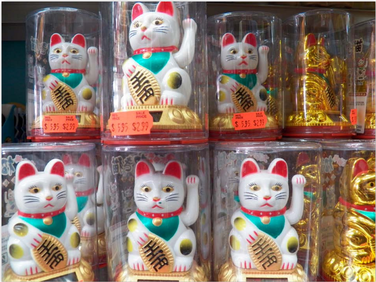
Chinese shop, San Francisco. Any object can be an Ethnic Marker. Not the price, material, shape, or use matter, but the feelings attached to the object.