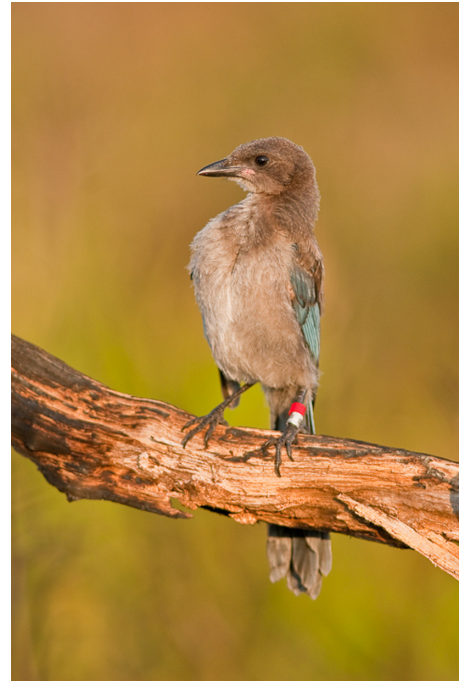
Figure 1. A juvenile Florida scrub-jay. Although juveniles have blue wings and tails like adults, they are easily distinguished by their brown heads, which are blue in adults.

test the significance of the phenotypic and genetic correlations, we constrained the correlation to zero or one and compared the model to one in which the correlation was estimated. Note that because correlations (or more generally, covariances) need not be positive, these tests are chi-squared distributed with 1 degree of freedom. All quantitative genetic models were run using the software ASReml 3.0 (Gilmour et al. 2009).