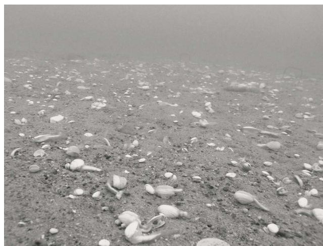
Figure 1 | Dead adult bivalves on the sediment surface after a hypoxic disturbance event, which resulted in major changes in ecosystem function. The bivalves Mya arenaria and Macoma balthica are comparatively long-lived and the mature stages may take 5–10 years to re-establish after disturbance.

The two different sampling occasions were combined in our analysis of both macrofauna and fluxes to increase replication of our study. Bottom water temperature was 19°C at T1 and 13°C at T2. Water column concentrations of oxygen and nutrients differed slightly