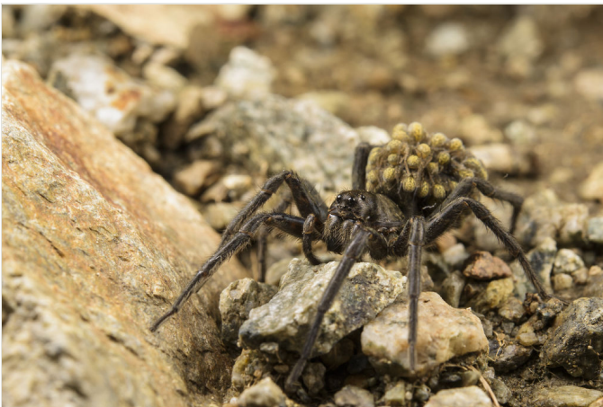
Figure 2. Vesubia jugorum — female with spiderlings.