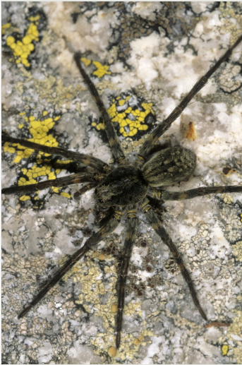
Figure 1. Habitus of Vesubia jugorum — female.