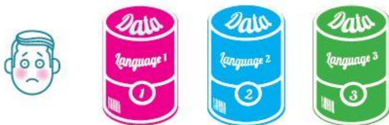
Figure 1: Isolated indexing - isolated data

provider could still make the metadata freely available. Furthermore, in fields such as bibliometrics and digital humanities, metadata is treated as important research material in its own right, and research can suffer from gaps and errors in collection description and metadata management.