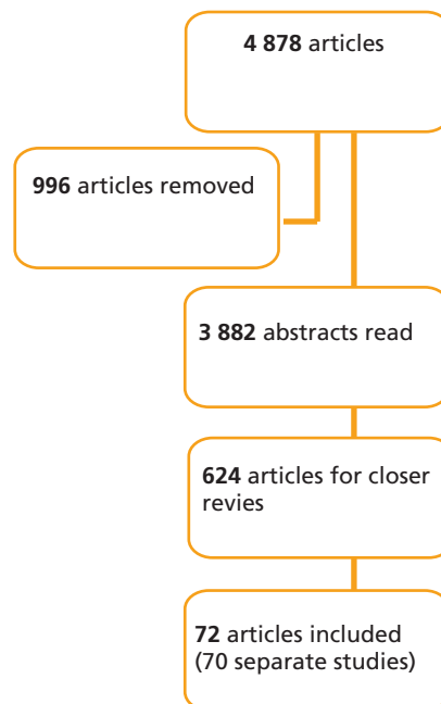
FIGURE 2. Flowchart showing the selection of articles

The literature search identified 4 878 publications (Figure 2). However, 996 were reviews, letters, or editorials and, given that we were looking for original studies, were not included for further review. Furthermore, the 996 articles were excluded if they included publications dealing with prevention or screening, topics which had been decided to be excluded from the review. Thus we were left with 3882 articles altogether that potentially reported QALYs as outcome measures. After screening of abstracts, 624 full-text articles were selected for closer inspection. Of them 72 (representing 70 separate studies) were deemed to fulfil the selection criteria and were included in the review. In 80 cases (13 % of the 624 full-text articles) the initial evaluation by the two independent reviewers differed regarding whether the article was based on clearly identifiable HRQoL data obtained with a valid instrument or not. In those cases the article was also evaluated by a third evaluator and the final decision was made in a consensus meeting. Of those 80 articles, 18 were finally deemed to merit inclusion in the review.