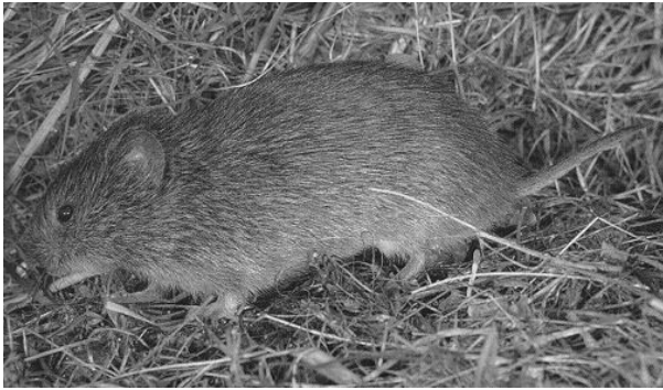
Fig. 4. The field vole ( Microtus agrestis ).

The field vole ( Microtus agrestis L. 1761, Arvicolidae, Rodentia) (Fig. 4) is a small rodent species common in both Scandinavia and Central Europe (Björvall and Ullström, 1995). It lives principally on open grassland, cultivated land or alpine meadows. The BM of an adult male field vole is approximately 40 g and the BM of a female 35 g (Krapp and Niethammer, 1982). The species reproduces between April and September as a seasonal breeder influenced by the photoperiod. After a 20-day pregnancy the female gives birth to a litter of up to five individuals, and it can be fertilized again almost immediately (Myllymäki, 1977). The animals reach sexual maturity at the age of 50-60 days.