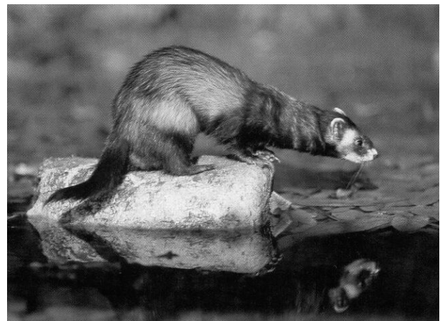
Fig. 3. The European polecat ( Mustela putorius ).

The reproductive season of the polecat is between March and June (Björvall and Ullström, 1995). Unlike some other mustelids no delayed implantation is encountered. The female gives birth to 5-10 cubs after a gestation period of 40-42 days.