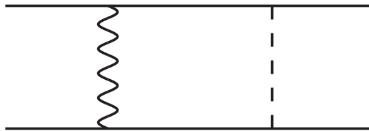
Figure 1. Diagrams giving rise to the leading-order contribution to C(x_\perp) . Wilson line (solid), showing the exchange between lines of an A field (wiggly) or a \Phi field (dashed)