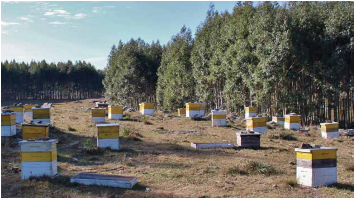
A beekeeper's apiary inside a eucalypt plantation in Río Negro, Uruguay.