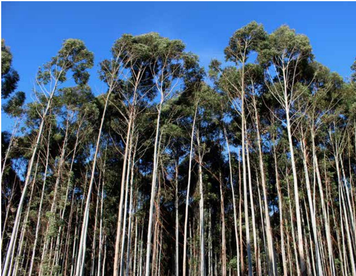
A pulpwood plantation of Eucalyptus grandis in Durazno, Uruguay.

In 2012, 46.3% (770.2 M m 3 ) of all industrial round wood harvested was removed from planted forests, the majority of which were large-scale tree plantations that occupied a total of 54.3 M ha of land (Indufor 2012; Payn et al. 2015). Large-scale tree plantations, most of which are located in Asia and the Americas, can occupy anywhere from hundreds of hectares to hundreds of thousands of hectares under government or commercial management (Kanowski and Murray 2008). Such plantations often comprise a single monoculture or a few relatively productive and predominantly exotic tree species that are intensively managed for varying commercial purposes, mainly for timber and pulpwood, but also for biofuels and carbon credits (Batra and Pirard 2015; Borrás et al. 2015; Ingram et al. 2016).