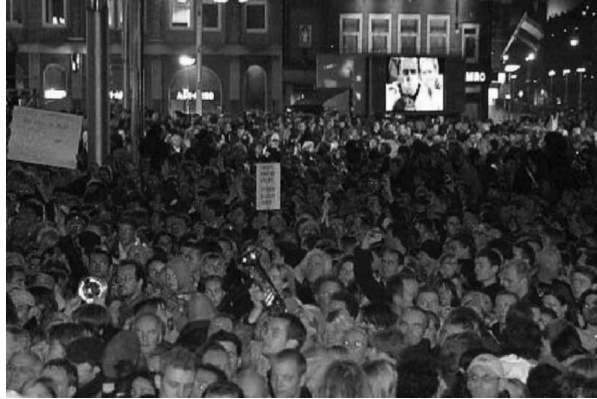
Figure 2 Amsterdam people protest the murder of Theo Van Gogh on Dam Square by making noise for seven minutes

“enslaved” Muslim women, as well as with his anti-Muslim columns and offensive comments about Muslims. He dubbed Muslims “ geiteneukers ” (“goat fuckers”) and “ kinderverkrachters ” (“child rapists”), and described Islam as a “retrograde and aggressive” faith. Immediately after the murder a leading government minister called his murder an act of war, and ethnic and religious conflicts worsened to the point of open violence, even outside of urban areas. In addition to some large-scale police raids, the next two weeks saw more than 20 arson and bombing attacks and counterattacks on mosques, churches, and other institutions. Furthermore, following the assassination the popular mood has continued to shift sharply against immigrants. 3