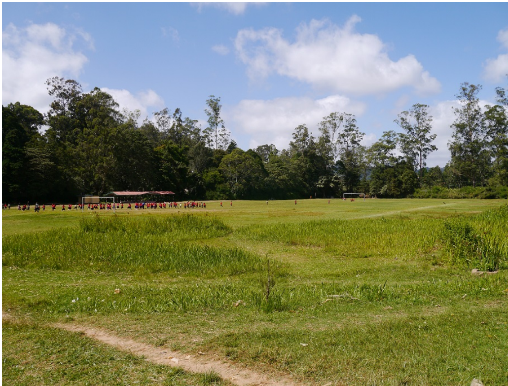
Figure 2: Dawson Mwanyumba Stadium in Wundanyi village is a former wetland that was desiccated by planting of eucalyptus trees to its margins. Source: authors.

To summarize, the general local people's framing of the eucalyptus problem focuses, on the one hand, on the negative impacts of the eucalyptus on local water resources and thus people's livelihoods and, on the other hand, on the loss of indigenous forests and associated cultural values due to exotic tree planting. Local people also recognize the economic benefits of eucalyptus, but claim that the plantations should not harm water resources and that the sharing of benefits should be equal.