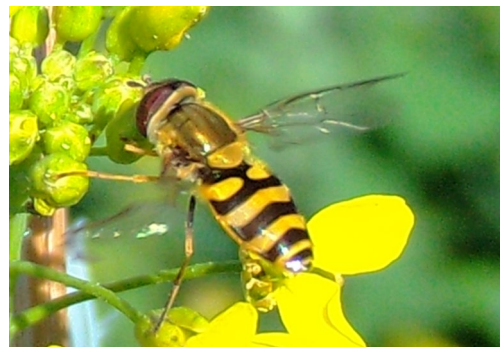
Fig. 3 Hoverfly, an important component in ecostacking, visiting rapeseed flowers.

Handling the EU’s Horizon 2020 biocontrol-founded project “EcoStack” illustrates lack of transparency concerning IP rights and copyright protection at the EU-level. The project proposal addressed the call SFS-28-2017, and was created, written (for the most parts), and submitted by