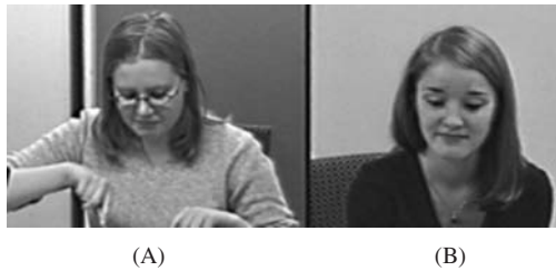
FIGURE 17 Extract 5, frame 12.