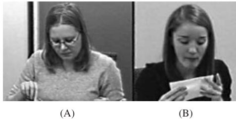
FIGURE 4 Extract 2, frame 1.