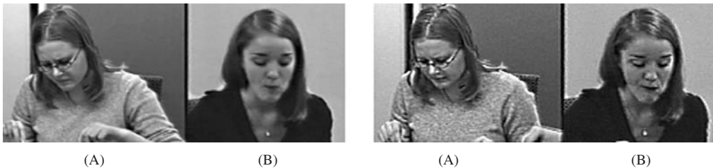
FIGURE 2 Extract 1, frames 1 and 2. (A), speaker; (B), recipient.