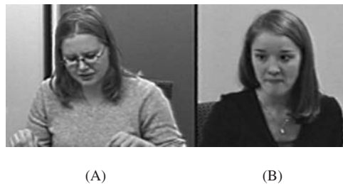
FIGURE 3 Extract 1, frame 3.

There is a 3 sec pause prior to the onset of the second story (starting in line 9). During that silence, A frowns (frame 1). As the preceding sequence has been closed (see lines 1–7) and the participants have temporarily withdrawn from mutual engagement (note their gazes in frame 1), A's frown is associated with potentially forthcoming rather than preceding talk. The frown hints that the talk that is yet there to come will have some problematic edge in it. In retrospect this can be seen as the first index of the stance to be taken in the upcoming talk (cf. Maynard, 2003, p. 92).