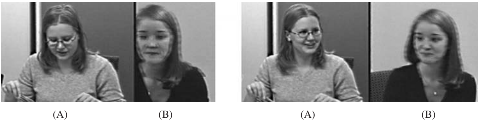
FIGURE 11 Extract 4, frames 4 and 5.