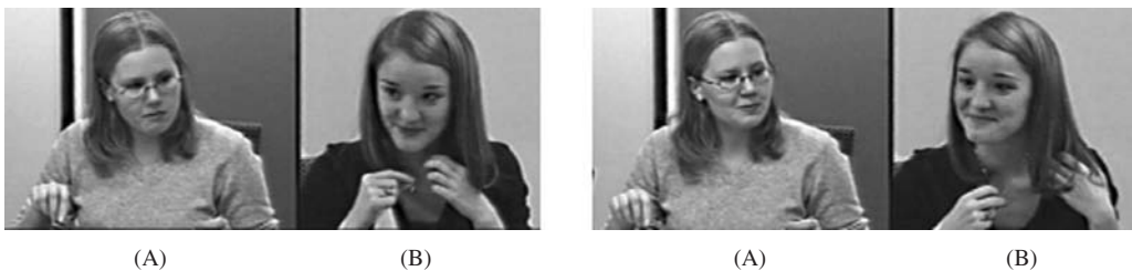
FIGURE 6 Extract 2, frames 3 and 4.