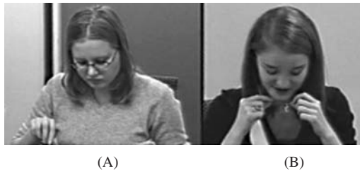
FIGURE 5 Extract 2, frame 2.