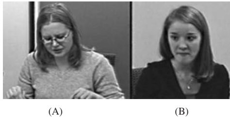
FIGURE 10 Extract 4, frame 3.