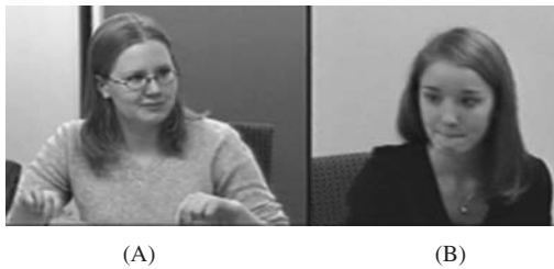
FIGURE 16 Extract 5, frame 11.