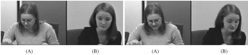
FIGURE 13 Extract 4, frames 7 and 8.