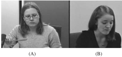
FIGURE 15 Extract 5, frame 10.