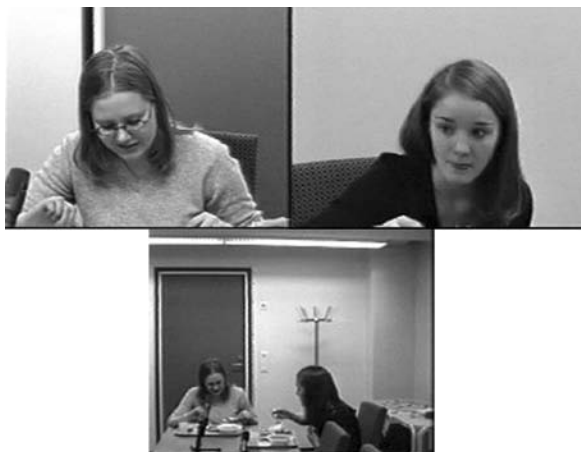
FIGURE 1 Seating arrangement.

Our data consist of Finnish two-party everyday conversations. A somewhat constrained environment was needed to secure the technical quality of recordings necessary for the analysis of facial expression. We invited dyads of students (who were friends or acquaintances) to have a free lunch while their interaction was recorded with three video cameras. The lunches took place in a room adjacent to a student refectory. Figure 1 shows the seating arrangement