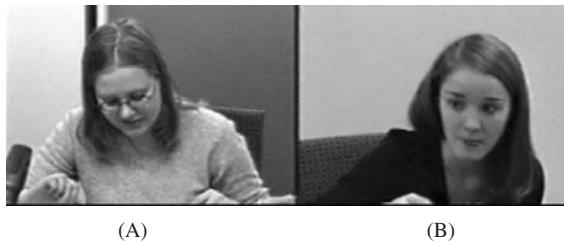
FIGURE 12 Extract 4, frame 6.