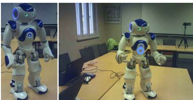
Figure 1. The NAO robot in the centre of the study setting.

Eye gaze was measured using SMI Mobile eye-tracking glasses (SMI ETG 2 Wireless 60 Hz), and the data created using a Lenovo X230 laptop with Intel® Core TM i7-3520M CPU 2.90 GHz. Statistics were calculated using IBM SPSS Statistics 22.0.