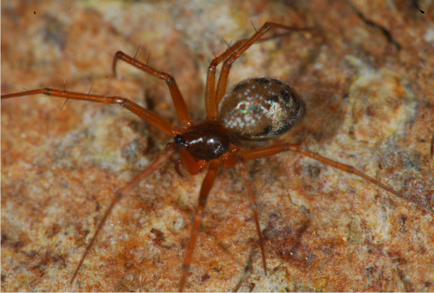
Figure 5. doi

Tenuiphantes miguelensis (Wunderlich, 1992).