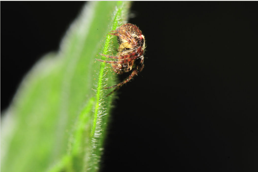
Figure 6. doi

Tenuiphantes miguelensis (Wunderlich, 1992) (Credit: Pedro Cardoso).