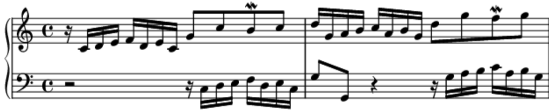
Example 2.5: Bach, Invention in C Major, No. 1, BWV772, mm. 1-2 (initial statement)

The subject is very short, and can be seen consisting of only seven notes. The following leap up to g^1 already begins the countersubject as the subject is introduced in the bass. In m. 2 the subject and the countersubject occur on the dominant. Later in mm. 15-19 a descending-fifths sequence occurs. Example 2.6 shows a detailed comparison sheet regarding the descending-fifths sequence. The imitative nature of the sequence is also reflected in my harmonic reduction in the second system of Ex. 2.6. In the first measure of the sequence, the right hand features a passing tone g^2 that leads to the f^2 of the next measure. In the second measure, the left hand features the passing tone c that leads to the B of the next measure. Such dialog of passing tones is absent from the corresponding Fenaroli sequence. Another difference is that the Fenaroli sequence features four voices instead of the two voices present in my harmonic reduction. Additionally, the Fenaroli sequence does not feature the c -sharp leading tone that puts emphasis on the D -minor harmony, but features a natural c instead. In Bach's realization, the c -sharp in m. 15 of the left hand suggests a D -minor harmony, and the b -flat in m. 18 indicates that the trajectory of the sequence is towards F major. In summary, the Fenaroli sequence differs in its non-imitative nature, in the absence of passing tones, in the absence of the D -minor leading tone and in its number of voices.