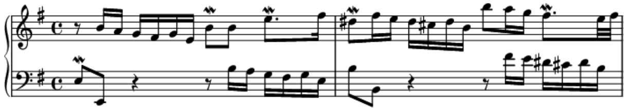
Example 2.10: Bach, Invention in E Minor, BWV 778, No. 7, mm. 1-2 (initial statement)

The subject is very short, similar to the subject in Bach's Invention in C Major, no. 1, discussed in subchapter 2.3. The next note b^1 can already be seen as part of the countersubject for the subject occurrence in the left hand. Since what I call the countersubject occurs only seldom throughout the invention, it could also be called free counterpoint. In m. 2 the subject and countersubject occur on the dominant harmony. In mm. 3-5 a descending-fifths sequence occurs. Example 2.11 shows a detailed comparison sheet of the descending-fifths sequence. The harmonic reduction in the second system of Ex. 2.11 shows that the two voices form thirds and follow a descending-fifths pattern, as was the case in the previous subchapter. Except for the number of voices and the melodic contour of the upmost voice, the corresponding Fenaroli sequence is also very similar when transposed to the key of the invention.