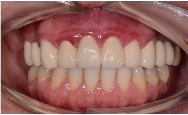
Fig. 1. Clinical picture of periodontal disease. A gingivitis patient has bleeding gums with classical signs of inflammation: pain, redness, and swelling. Plaque-induced gingivitis is a reversible state without destruction of connective tissue. Gingivitis may transform into periodontitis in susceptible individuals and always precedes periodontitis, which is characterized by an irreversible loss of tooth-supporting tissues. Periodontal diseases are always diagnosed by a dentist and require professional treatment.

[8], is reduced in patients undergoing ICT was not addressed in the study by Masi and co-workers [2]. This could be of importance since the neutrophil proteolytic activation cascade represents an apparent mechanistic link between periodontitis and coronary heart disease and high levels of myeloperoxidase, a heme protein abundantly present in neutrophils, are associated with periodontitis, diabetes, CVD, and endothelial dysfunction [8,9].