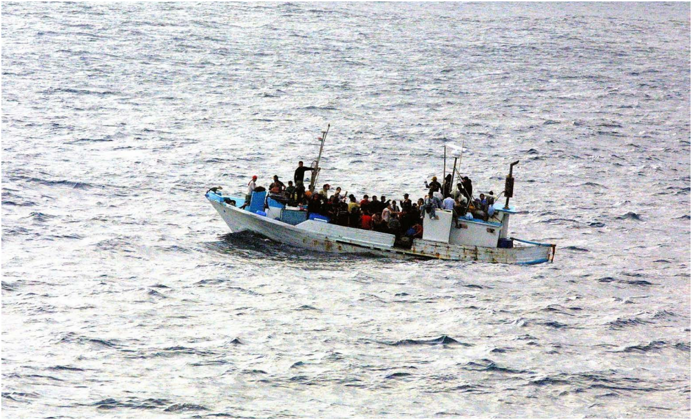
Only the most recent, 2014 book, discussed refugees.

vein to the above-mentioned Roma text, it is also a case of a one-page information box (with the title ‘Fortress Europe – no entry’), discussing current societal topics. As the discussed phenomena relate to the arrival of refugees after the so-called Arab Spring of 2011, a similar discourse was not possible in the older books. The text separates migrants in accordance with how welcome they are: