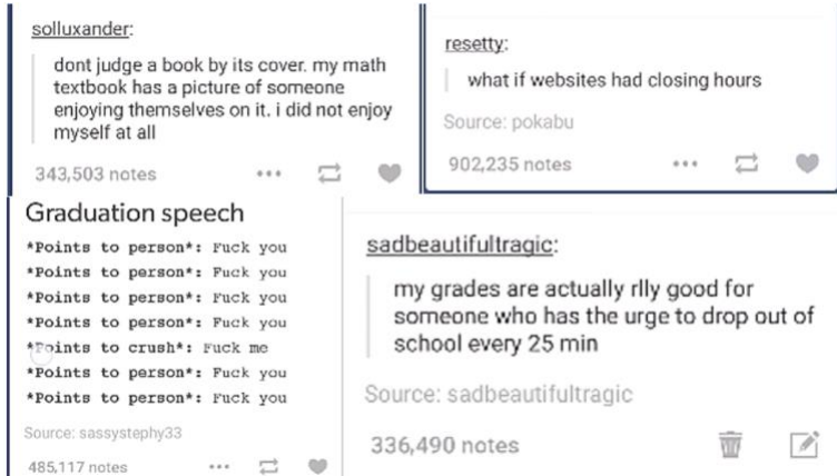
Figure 2: Quotes.