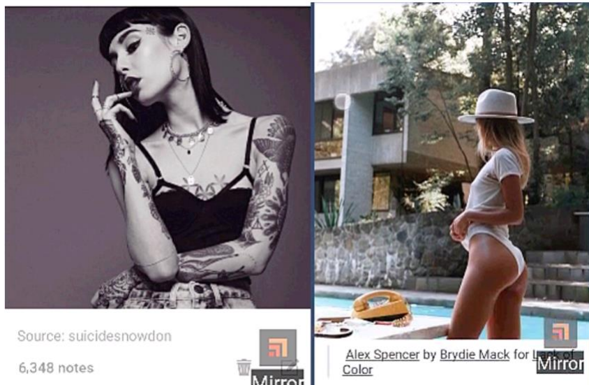
Figure 4: Bodies as canvases.