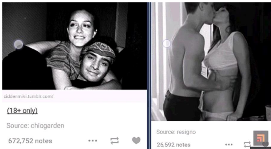
Figure 3. Desiring bodies.