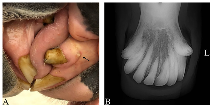
Figure 3 (a) Representative photograph of horse 13 showing a small draining tract (arrow) on the gingival surface of tooth 304. Mild bony swelling of the gingiva is also evident. (b) Intraoral radiograph of the mandibular incisor and canine teeth of horse 13 demonstrating hypercementosis and resorptive lesions of varying degree in teeth 301, 302, 303, 403 and 404 (the lesions appear mild relative to those presented in figure 1). L, left.

It has already been established that EOTRH is a disease that primarily affects the teeth of older horses. The horses in most of the previous reports have been older than 15 years when first presented, 2 5 9 which is in agreement with our observations. However, one recent study noted that age is not a significant risk factor, 4 and Smedley and others 5 describe pathological manifestations of the disease in a 10-year-old horse. This is supported by radiographic evidence of resorption in even younger horses, although the frequency of all types of tooth resorption does increase significantly with age. 1 8 Most of the horses in the study had severe