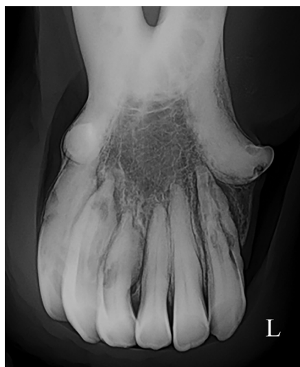
Figure 1 Intraoral radiograph of the mandible of horse 19 showing hypercementosis and resorptive lesions in teeth 302, 303, 304, 401, 402 and 403. Hypercementosis predominates in the teeth on the right side, whereas resorption is more evident on the left side. L, left.

The triadan 03 teeth were most commonly affected, followed by the triadan 02 teeth. The resorptive lesions within the teeth were most frequently located in both the apical aspect and the reserve crown (91/190 affected teeth), followed by the apical aspect (59/190 affected teeth) and the reserve crown (31/190 affected teeth).