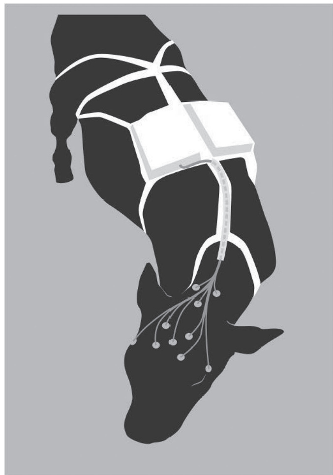
Figure 1. Position of the electrodes and equipment for electrophysiological recordings of vigilance states in dairy cows. Reprinted from Ternman et al. (2012) with permission from Elsevier.

The vigilance states NREM, REM, awake, drowsing, and rumination were scored in 30-s intervals as described by Ternman et al. (2012). Analysis of behavioral and electrophysiological data included total time and duration of bouts during the 24-h recording sessions. Duration per vigilance state (min) and the number of bouts for each vigilance state (min) were calculated as a percentage of total recorded duration for day (16 h) and night (8 h), respectively. Mean daily milk yield per recording session was calculated by summing the yields from each individual milking during the recording week and dividing it by the total number of milkings for the same week.