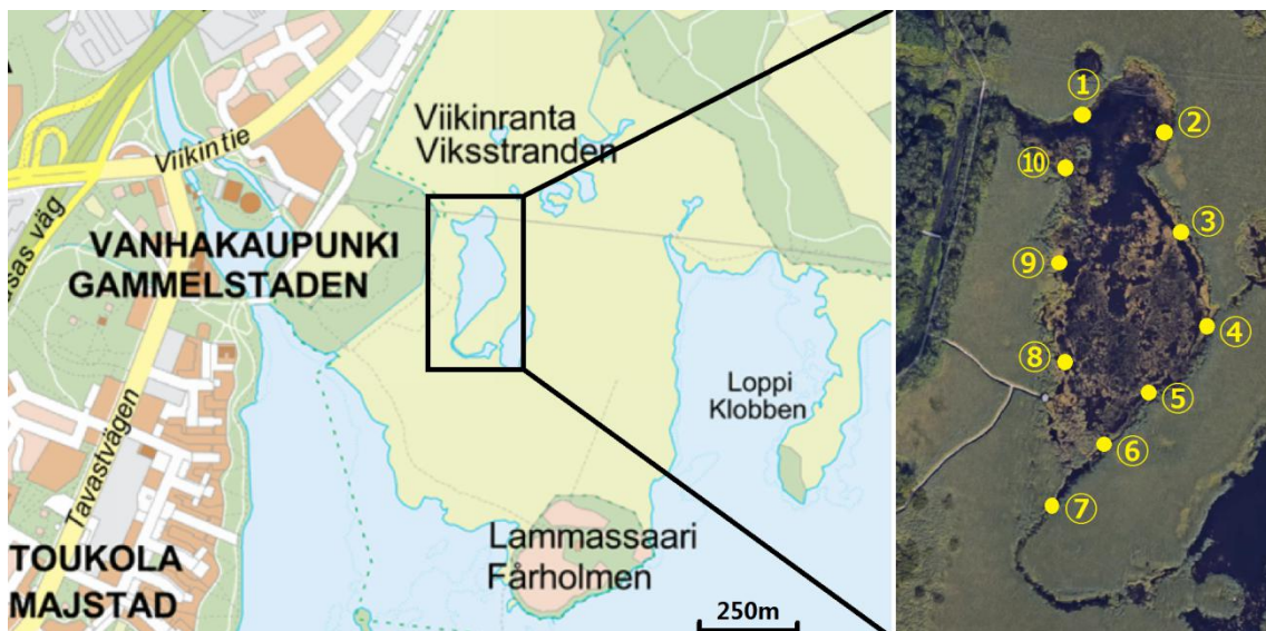
Figure 1. The location of the Muumilampi pond and the sampling spots.

Viikki Natura is also known as “Vanhankaupunginlahden Lintuvesi Natura 2000”, literally meaning “Natura 2000 of the Old Town Bay bird wetlands”. As its name suggests, this area provides important habitats for birds. [1] A wide range of bird species has been found in the Natura 2000, including vulnerable species, such as Common Mergansers ( Mergus merganser ) [2] . Besides, the Natura 2000 is also home to other wildlife, such as Moor Frogs ( Rana arvalis ) [3] and Roe Deers ( Capreolus capreolus ) [3] .