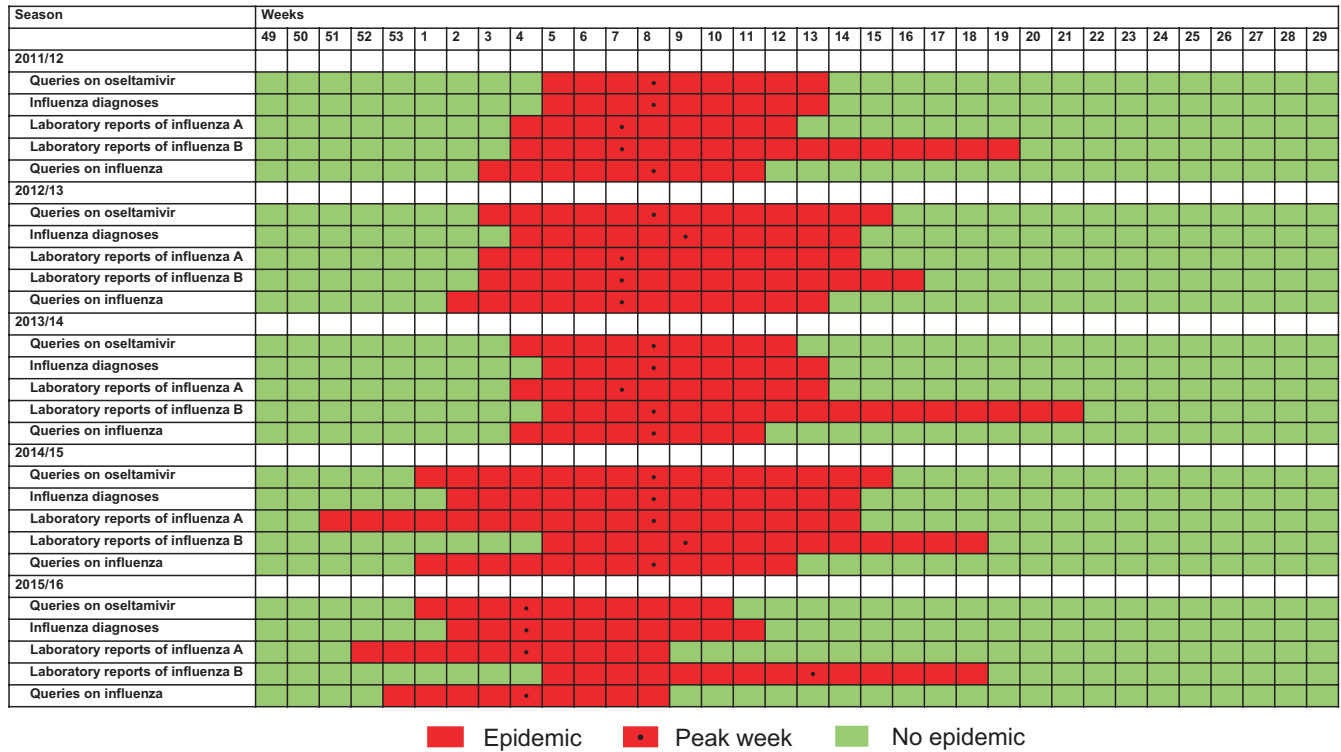
FIGURE 3 The MEM-calculated epidemic weeks (red) and non-epidemic weeks (green) on queries on oseltamivir, influenza diagnoses, laboratory reports of influenza A and influenza B, and queries on influenza by season. The black bullets indicate peak weeks during epidemic periods

platforms may provide HCPs with medical information of questionable quality. 27 Although influenza searches from Google have been assessed in terms of disease surveillance, this method included several weaknesses in timing and regional scales to predict influenza epidemics. 12-14 Notably, general search engines cannot characterize the users performing the searches. We have shown here that HCPs'