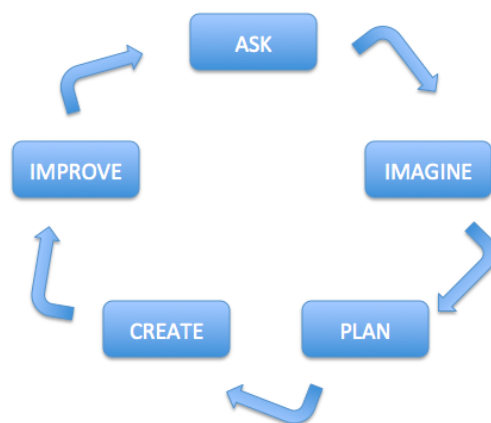
Fig. 1. The Design Framework used at the Ontario site.

In Canada, the design process was used in two ways during the March Break Camp -- first, it was used in a daily theoretical exercise with the students (responding to the challenges of training a new puppy) and second, it was used to frame the participants' week-long design project. At the Ontario site we adhered to the following cyclical five-stage design framework adapted from the Engineering is Elementary website (Museum of Science, Boston):