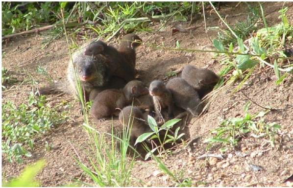
babysitters help a litter of pups