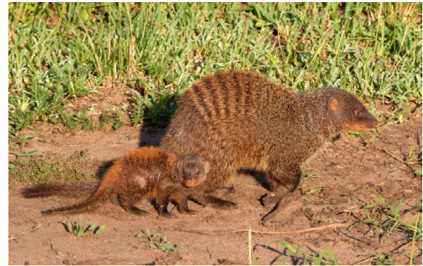
escorts provide one-to-one care