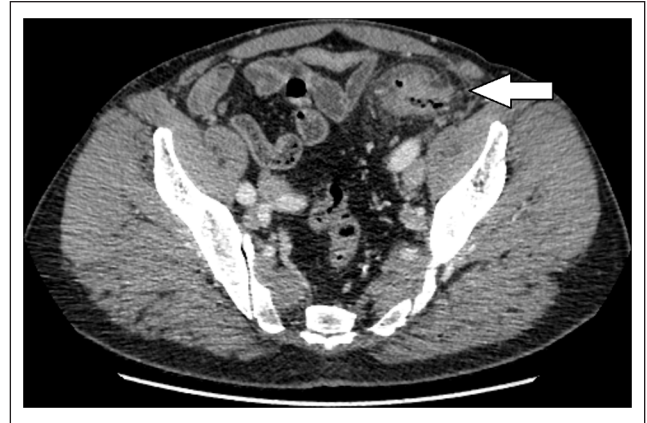
Fig. 1. A patient with lower left abdominal pain. This computed tomography scan of the lower abdomen shows colonic wall thickening in the proximal sigmoid colon, diverticula (arrow), and pericolic fat stranding. A diagnosis of uncomplicated diverticulitis was made.

In the pre-antibiotic era, treatment of diverticulitis consisted of bed rest and no or low residual diet. These treatments had a rather high symptomatic success rate (31). Despite the lack of controlled studies, antibiotics have been used to treat uncomplicated diverticulitis for many years. The reason for this recommendation was the belief that acute diverticulitis is caused by the translocation of intestinal bacteria through