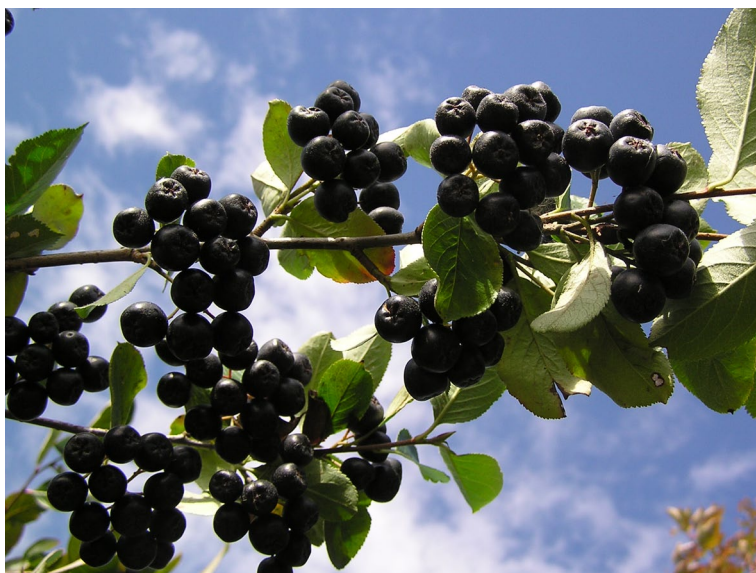
Fig. 2. Sorbaronia mitschurinii , fruiting branch. – Cultivation, 11 Sep 2004.

hybridogenous genus is Sorbocotoneaster Pojark. The natural hybrid between Sorbus aucuparia L. and Cotoneaster laxiflorus Lindl. (syn. C. melanocarpus (Bunge) Loudon), Sorbocotoneaster pozdnjakovii Pojark., was studied morphologically (Pojarkova 1953) and cytologically (Krügel 1992). Three distinct, yet sympatric, morphotypes were discovered: the primary hybrid (triploid) closely approaching S. aucuparia , the putative backcross with S. aucuparia (tetraploid) intermediate between the parents, and the putative backcross with C. laxiflorus (pentaploid) closely approaching C. laxiflorus . If it were not for the apomictic reproduction, A. mitschurinii would have been taxonomically included in S. fallax ; as far as its taxonomic separation is maintained, its transfer to Sorbaronia is justified and is consequently effected here.