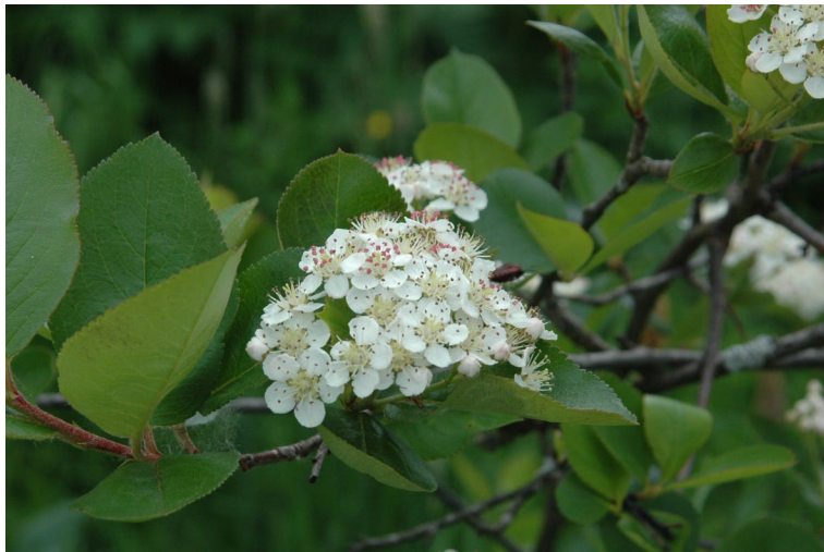
Fig. 1. Sorbaronia mitschurinii , flowering branch. – Cultivation, 29 May 2011.

In spite of the intergeneric origin, Leonard (2011) decided to maintain Aronia mitschurinii in Aronia because of its greater similarity to the species of the latter. However, an analogous case when variable intergeneric hybrids with Sorbus as one of the parents are accommodated in a single