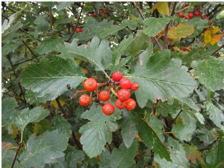
Fig. 5. Sorbus tauricola , fruiting branch showing the glossy upper side of the leaves. — Crimea, Ai-Petri Mt, 25 Sep 2010.

The Crimean whitebeams that belong to the apomictic complex of Sorbus latifolia (Lam.) Pers. s.l. were first discovered by Zelenetzky (1906), who identified them as “ S. scandica Fries”. Stankov (1927) reported the plant as S. latifolia . Popov (1959a) acknowledged the isolated occurrence of the Crimean plants and their difference from Central European whitebeams and described the Crimean populations as S. pseudolatifolia K. Popov. Popov provided an extensive description in Latin but designated two gatherings as types, one in flower and the other in fruit, making the new name not validly published under Art. 40.1. Zaikonnikova (1985) renamed the species because of homonymy but omitted the type designation, and this issue was also neglected in a recent list of Ukrainian type specimens (Fedoronchuk 2006). The name suggested by Zaikonnikova is in current use (Czerepanov 1995; Mosyakin & Fedoronchuk 1999; Zaikonnikova 2001; Yena 2012) and is validly published here. Under Art. 46.5 and 46.10 its authorship is “Zaik.