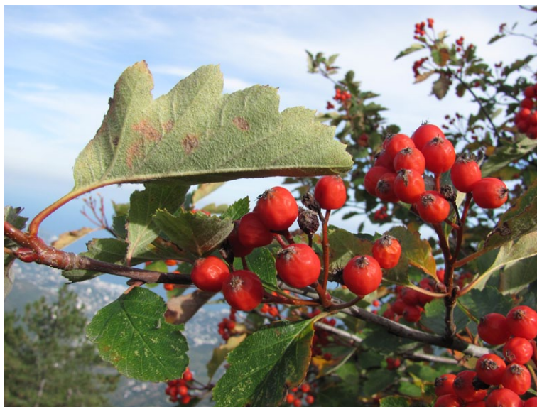
Fig. 6. Sorbus tauricola , fruiting branch showing the grey-green tomentose lower side of the leaves. — Crimea, Ai-Petri Mt, 25 Sep 2010.

ex Sennikov”; the name may not be attributed to Zaikonnikova alone under Art. 46.2.