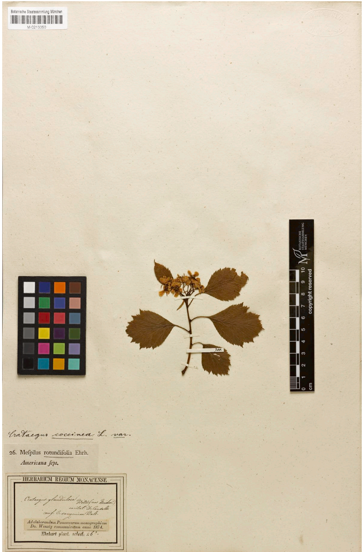
Fig. 3. Neotype of Mespilus rotundifolia – Ehrhart (1792), Plantae selectae hortuli proprii 3: No. 26 (M 0213350).