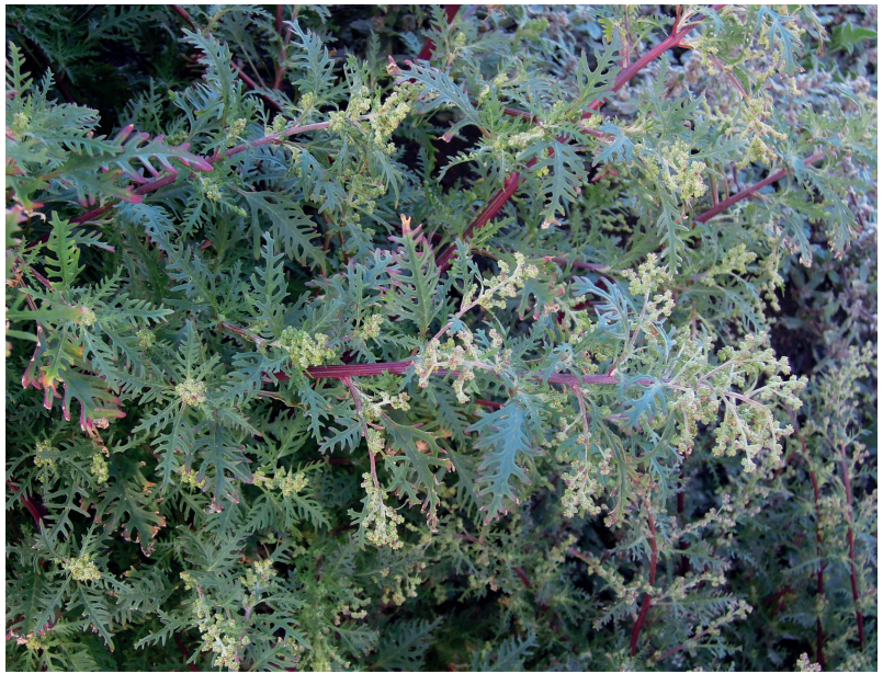
Fig. 2. Chenopodiastrium coronopus . Spain, Canary Islands, El Hierro, 21 March 2013.

ined.; no. 3 Moq.; Cette petite Chénopodée est très rare je l'ai bien cherché je ne peut trouver que le seul exemplaire; la Isletta de Gde Canaria, 11. mars 1846, Bourgeau s.n." (FI, Herbarium Webbianum; image in JSTOR Global Plants!). — ISOLECTO-TYPE: " Chenopodium coronopus spec. nov.; no. 3 Moq.; petite Chénopodée (?) très rare elle est annuel. Canaria Isleta – In arenis littora, mars 1846; M. Bourgeau " (P00083265, Herbarium A. Moquin-Tandon!; image in JSTOR Global Plants).