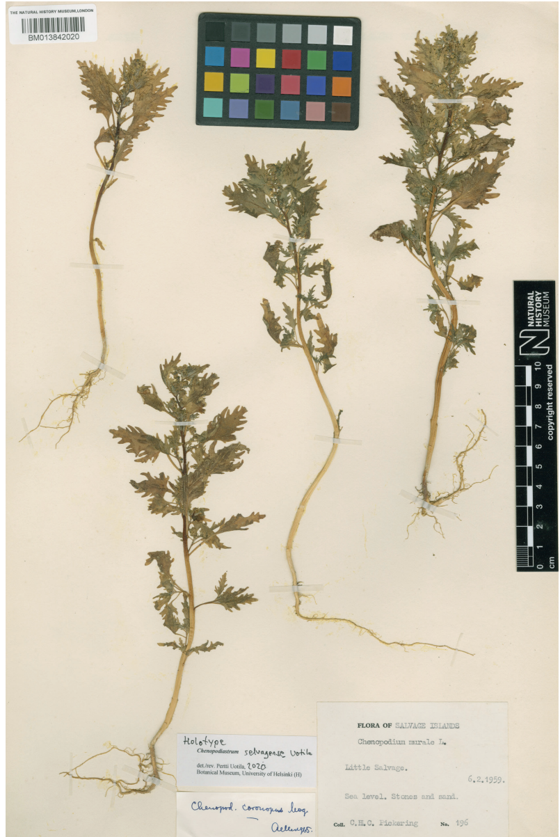
Fig. 3. Holotype of Chenopodium selvagensis (BM013842020).