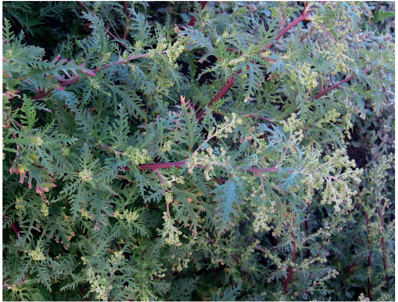
Fig. 2. Chenopodiastrium coronopus . Spain, Canary Islands, El Hierro, 21 March 2013.

ined.; no. 3 Moq.; Cette petite Chénopodée est très rare je l'ai bien cherché je ne peut trouver que le seul exemplaire; la Isletta de Gde Canaria, 11. mars 1846, Bourgeau s.n." (FI, Herbarium Webbianum; image in JSTOR Global Plants!). — ISOLECTO-TYPE: " Chenopodium coronopus spec. nov.; no. 3 Moq.; petite Chénopodée (?) très rare elle est annuel. Canaria Isleta – In arenis littora, mars 1846; M. Bourgeau " (P00083265, Herbarium A. Moquin-Tandon!; image in JSTOR Global Plants).