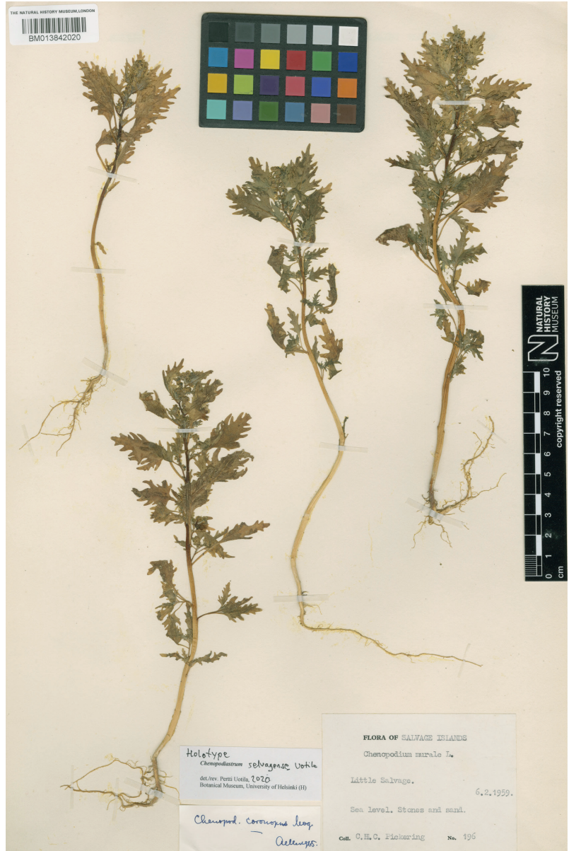
Fig. 3. Holotype of Chenopodium selvagensense (BM013842020).