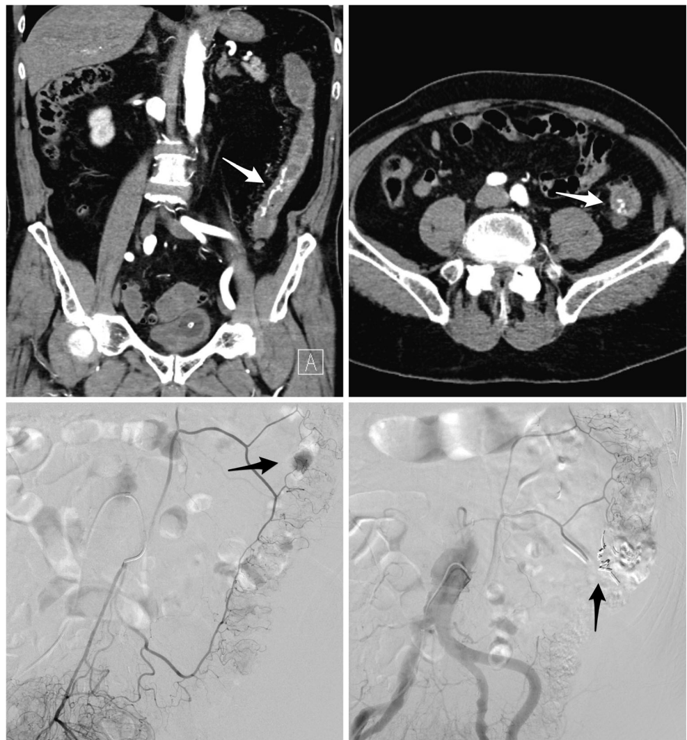
Fig. 1 An 81-year-old man presented with profuse rectal bleeding. Computerized tomography angiography was positive, showing contrast extravasation and diverticulosis in descending colon (white arrows, top left and right). Immediate angiography took place. Contrast extravasation from the inferior mesenteric artery (black arrow, bottom left) was successfully controlled with coils (black arrow, bottom right). Severe post operative abdominal pain occurred. Two days after embolization sigmoidoscopy showed transmural ischemia in left hemicolon, necessitating left hemicolectomy

particles being the methods used. Provocation of the bleeding did not occur. When angiography remained negative despite active bleeding in CTA or endoscopy, empirical embolization of the suspected bleeding artery took place in a few complicated cases where laparotomy would have been unfavorable.