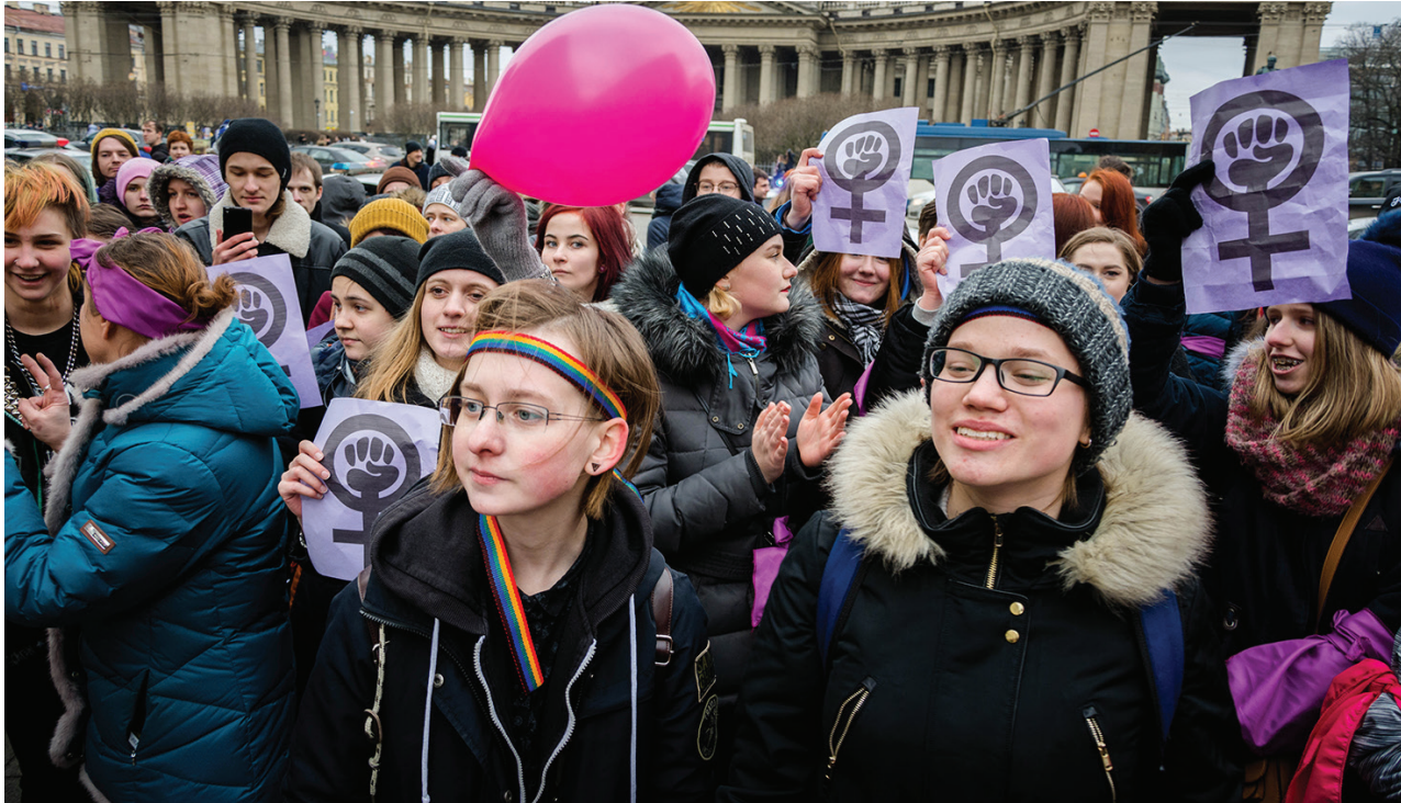
Photo credit: Women protest at a feminist rally in St. Petersburg, Russia: Farhad Sadykov, Shutterstock, March 2017

Each of these mass media campaigns has revealed so many stories of violence against women in Russia that it has been difficult to ignore.