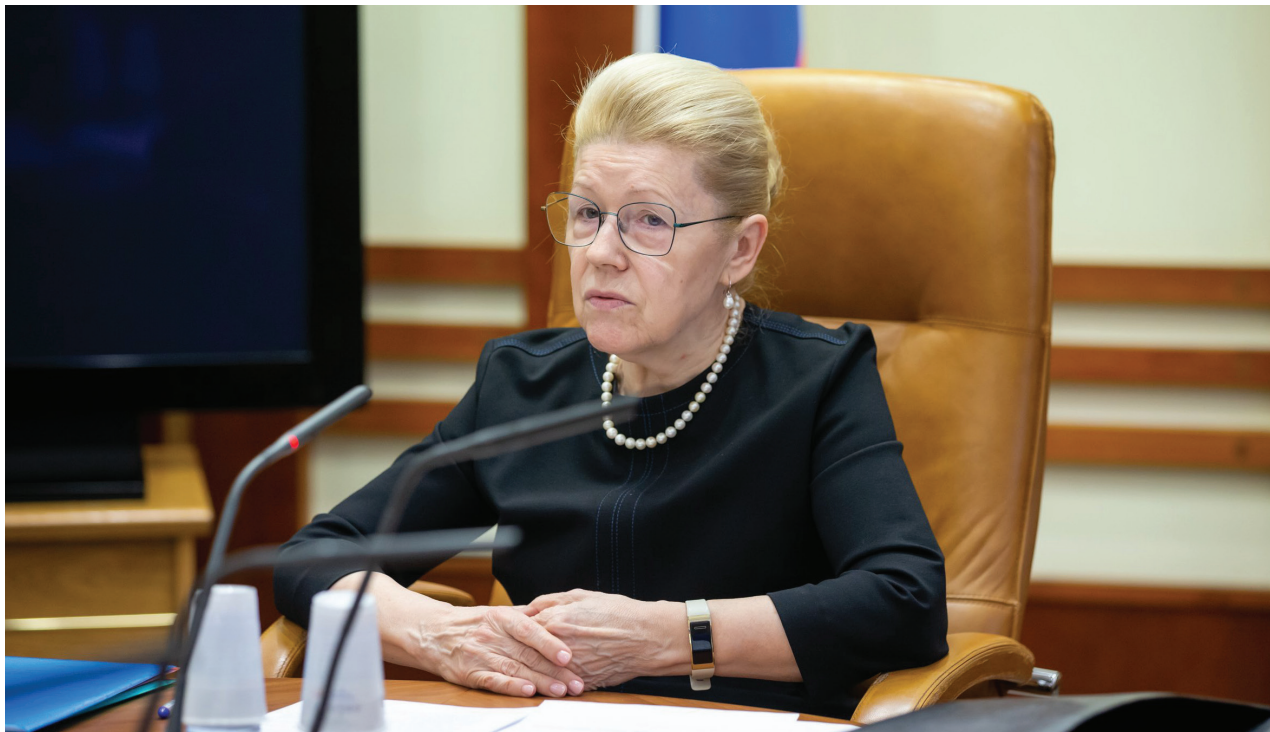
Photo credit: State Duma deputy Elena Mizulin at a meeting of the interim commission of the Federation Council in Moscow, Russia: Federal Assembly of the Russian Federation, February 2020

failure to make violence against women central to the women's rights agenda.