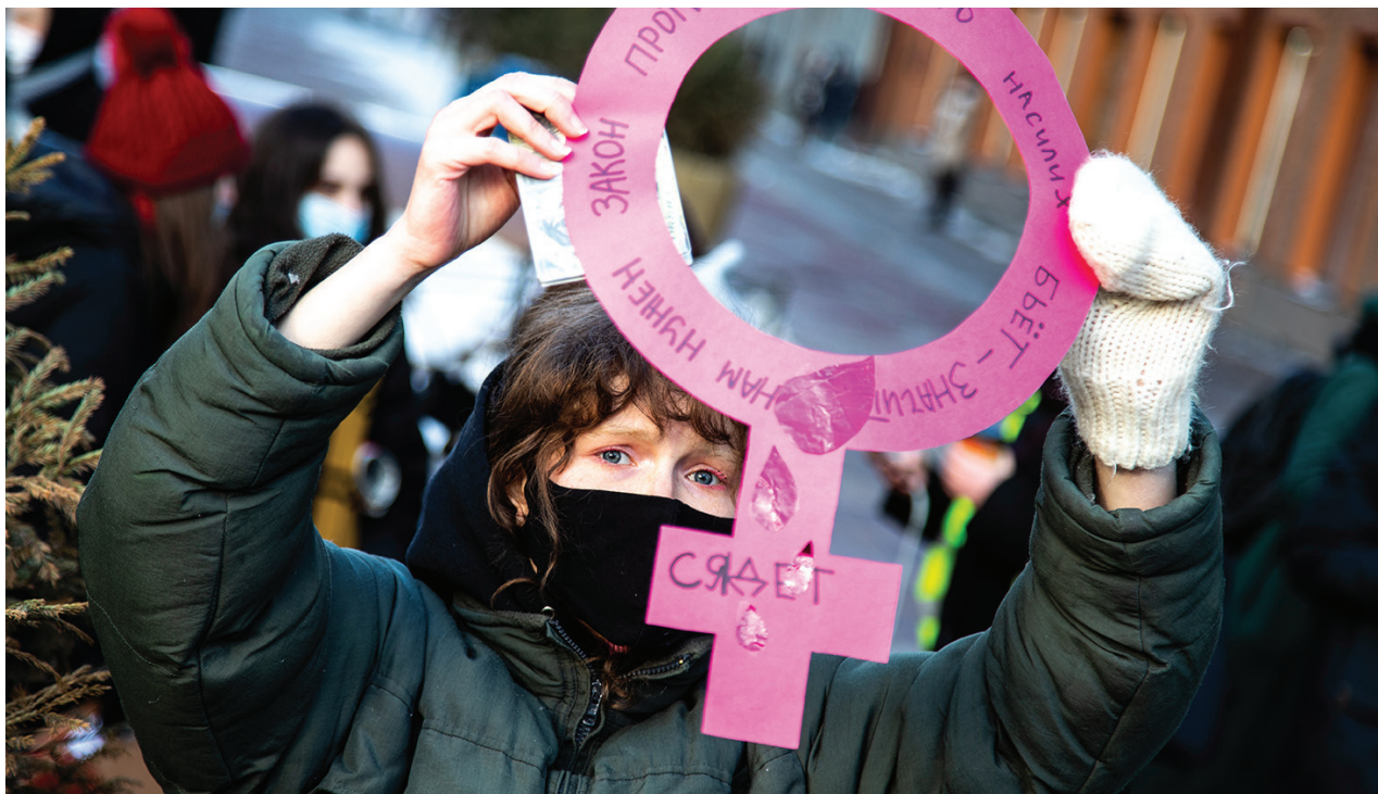
Photo credit: Activists at a rally for women's rights in St. Petersburg, Russia: Konstantin Lenkov, Shutterstock, March 2021