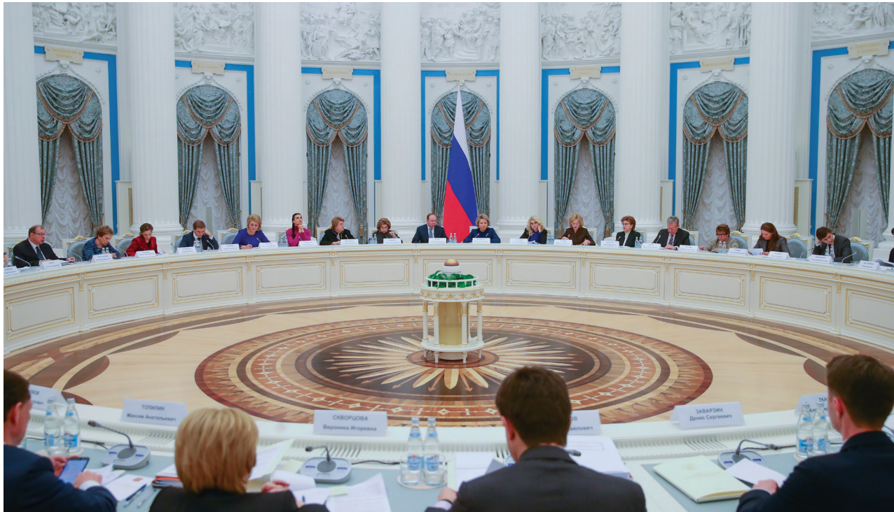
Photo credit: A meeting of the Council under the President of the Russian Federation in Moscow, Russia, regarding state policy around family and child protection: Federal Assembly of the Russian Federation, November 2019

that made the provisions of the draft moot, in their opinion. 19