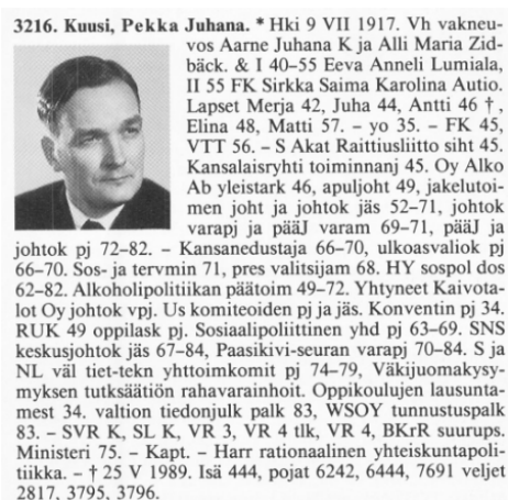
Fig. 1. A short biographical entry in the register book Norssit 1867–1992

Extracting Structure from Text The project started by digitizing the the book at the Digitization Centre of the National Library of Finland. As a result, an OCR-version in XML of the book pages was obtained, including coordinates of detected images of persons. The data extracted was then transformed into RDF form, where each biographical entry was extracted from the OCR text. Also the photos of persons were extracted from the images of the book pages and linked