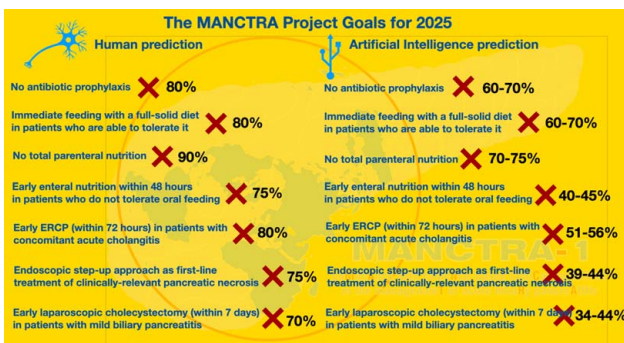
FIGURE 2. The MANCTRA project goals for 2025.

Twelve articles were analyzed, of which 7 were systematic reviews with meta-analyses of RCTs, 4 were systematic reviews and meta-analyses of RCTs and n-RCTs, and 1 RCT.