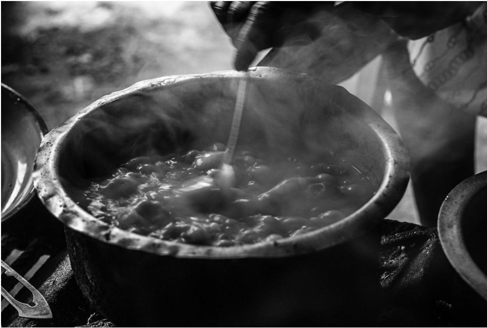
Figure 2. Food preparation in Muembe. Cooking pre-boiled beans with a bit of cabbage, carrots, green pepper and potatoes in a refogado of oil, tomatoes and red onion, seasoned with salt. This way of cooking is more common for urban Lichinga. A simple version of beans boiled in water with salt (and, if possible, a bit of cooking oil) is often the norm in rural Niassa.

memories of past times and places, which also shape the way we experience our relation to food in the present (see Figures 2 and 3 ).