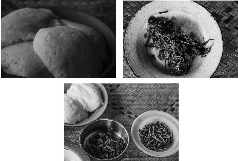
Figures 3. Our meal in Nzizi. Wugadi served with pumpkin leaves cooked with a bit of red onion and tomatoes, and dried usipa fish from Lake Niassa.

In recent years, the body and sensory experiences have gained growing attention in the study of African aesthetics, 21 though this has not yet included the study of food. Most contemporary literature on food in Africa still deals with food security and the biological necessity of eating. Yet there is a growing body of cultural studies research that looks beyond sustenance, at topics such as food and memory, 22 food and identity, 23 food and gender 24 and their various intersections. Moreover, lately, the sensory and affective aspect of