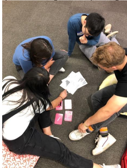
Figure 3. Participants reviewing data and planning their performance