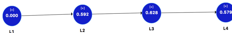
Figure 2. Constructs' cross-validity redundancy.

Q-square statistics, or cross-validity redundancy, measure the quality of the path model. Blindfolding is usually used to measure the Q-square [99]. It shows how much a conceptual model can predict the endogenous constructs. The Q-square values in the SEM analysis had to be greater than zero. Figure 2 shows that all the endogenous constructs had Q-square values greater than zero, which was higher than the threshold level. This supported that the predictive relevance of the model was satisfactory for the endogenous constructs.